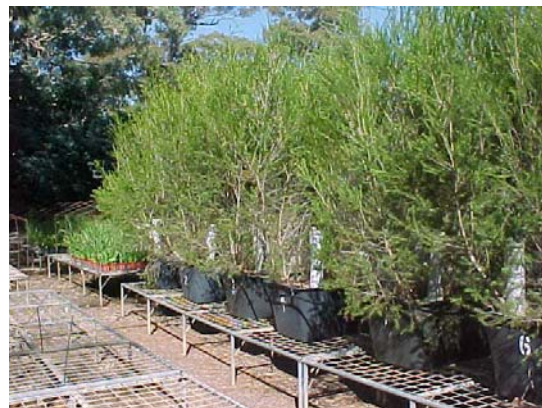
Figure 7. Assemblies with established melaleuca armillaris.