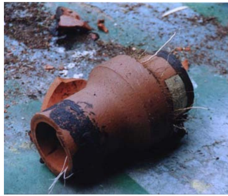
Figure 13. VC rolling ring joint with roots having entered past the seal.