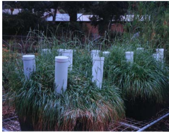
Figure 5. Assemblies with established rye grass.