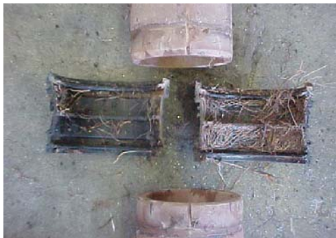
Figure 14 VC pipes jointed with a plastics coupling showed a mass of root intrusions when dissected.