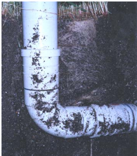
Figure 6. Rye grass roots binding all the soil together, including that below the assembly.