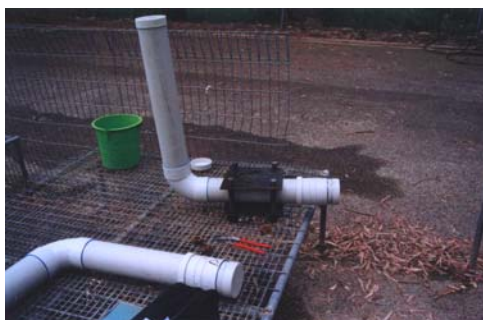
Figure 2. Horizontal assemblies. One with 7.5% deflection applied to the spigot via 2 parallel steel plates.