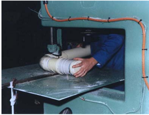
Figure 10. Cutting a PVC assembly with a bandsaw.