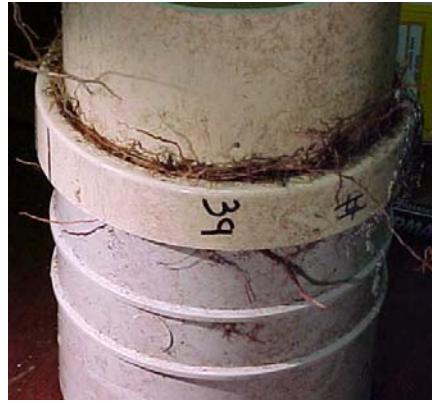
Figure 11. Melaleuca roots growing in the crevices at the socket of a PVC joint.