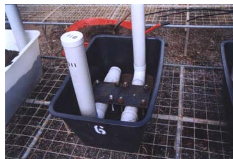
Figure 3. Two horizontal assemblies with 7.5% deflection applied and ready for burial.