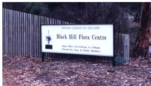
Figure 1. Entrance to Black Hill Flora Centre.