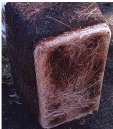
Figure 8. Melaleuca roots binding all the soil together.