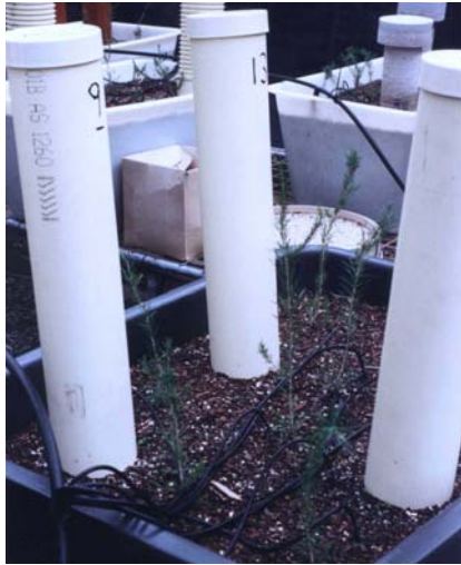
Figure 4. Horizontal assemblies with melaleuca seedlings.