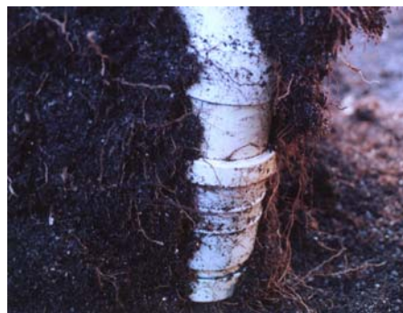
Figure 9. Melaleuca roots surrounding the joint.